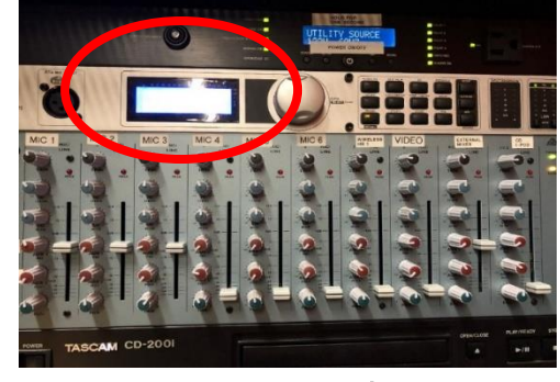
Once the readout screen is fully on it will say User 1 Hanna.

Next select the microphone (s) you want to use.